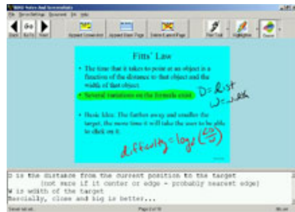
Figure 3: BIRD note-taking client with a PowerPoint slide captured and annotated with a highlighter and a pen, as well as typewritten notes.

Moving the splitter between the panes adjusts their heights. Any image and ink on the top pane is scaled when the pane is resized. The scaled ink is kept properly positioned relative to the scaled image. The text size in the bottom pane is not resized, though the user can configure the text’s font.