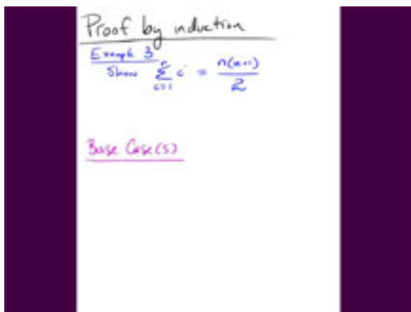
Figure 2: TMS Application student view with example notes for same proof as Figure 1 displayed.

In order for TMS to work, the TabletPC needs to have the screen extended to the VGA-out screen rather than having it mirror the tablet’s primary screen. The student view of the slides only displays the ink surface, not the toolbar and status bar. Since most projectors do not currently have the ability to rotate the image 90 degrees, I was inspired by the effect of “letter-boxed” movies to create the illusion of a portrait display. Figure 2 shows what is displayed by TMS in landscape-mode via VGA-out.