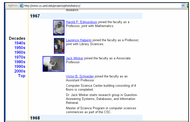
Figure 1: This depicts the initial design of the CS PhotoHistory photo libraries as a timeline of events and photographs of the Department of Computer Science at the University of Maryland. The hyperlinked faculty names lead to a page detailing information about that faculty member including field committee, dates, awards, and other biographical information.

These two domains served as the driving model towards a timeline of photographs (Figure 1) and events, along with a complete index of all faculty members since the department’s inception. Each member listed in the faculty index has his or her own page devoted to displaying all photographs and biographical information.