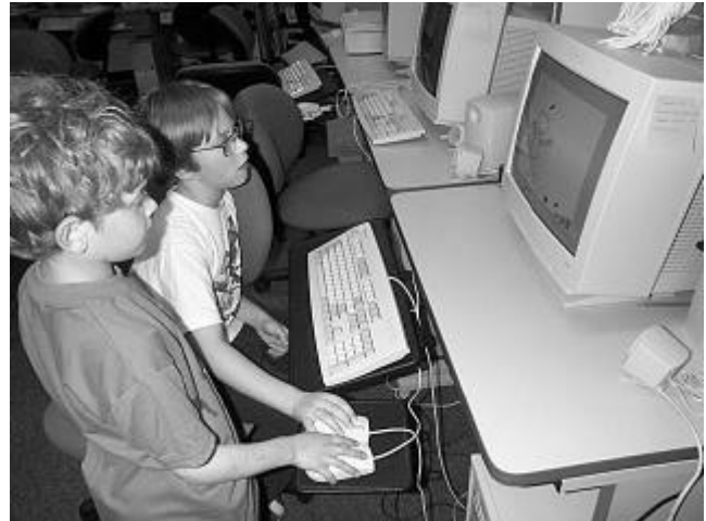
Figure 1: Two children using two mice with one computer. They are running KidPad, an application we wrote that uses MID.

SDG applications must deal with problems particular to their domain, and rules of interaction need to be considered. There are a range of issues that come up for builders of SDG applications. Providing interaction