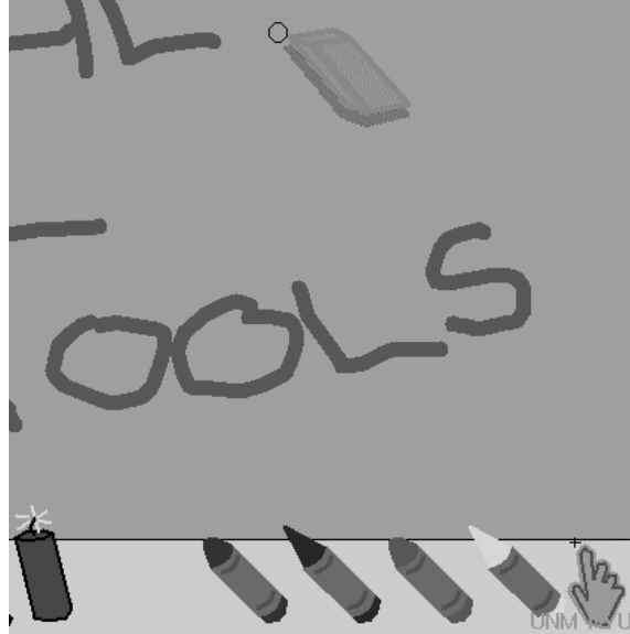
Figure 2: Some tools used in KidPad: An eraser, a bomb (for erasing an entire drawing), some crayons, and a hand (for moving objects).